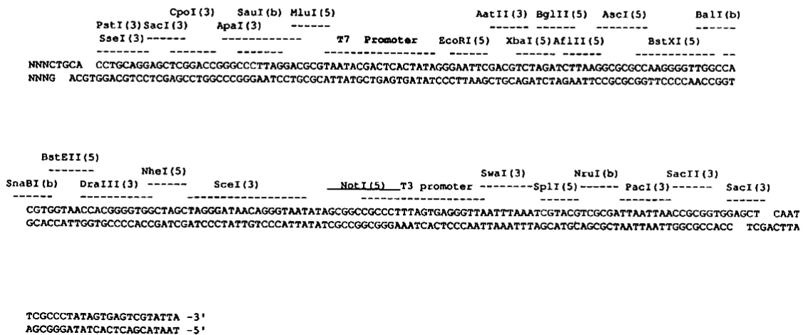
Fig. Structure of pLZ3 and the restriction sites

Ars is the S. pombe region required for replication in S. pombe , and Ori is an origin required for replication in E. coli .