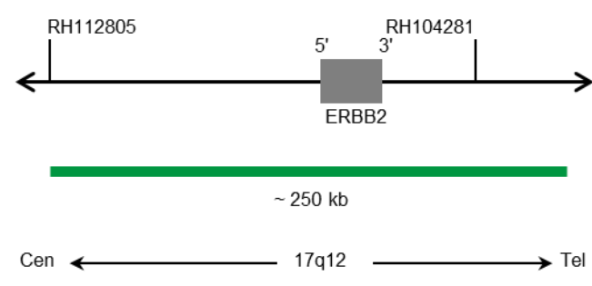
Fig. 1: SPEC ERBB2 Probe map (not to scale)

*according to Human Genome Assembly GRCh37/hg19