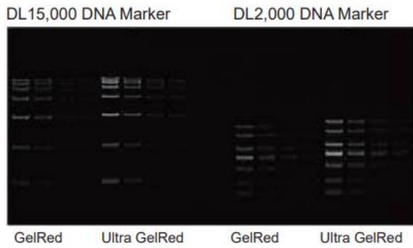
Fig 1. The results of Ultra GelRed and standard GelRed nucleic acid gel staining

Fig 1. and Fig 2. are Ultra GelRed dye nucleic acid electrophoresis and cell membrane permeability assay (cytotoxicity assay), respectively